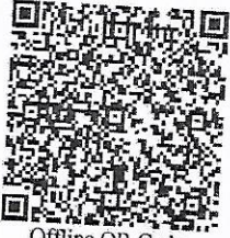
Offline QR Code