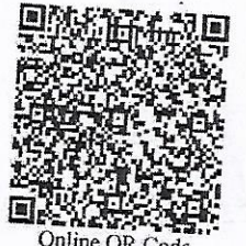
Online QR Code