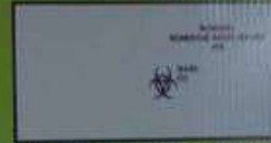
Collection of Biohazardous Wastes from institutions and sending it to common community incinerator