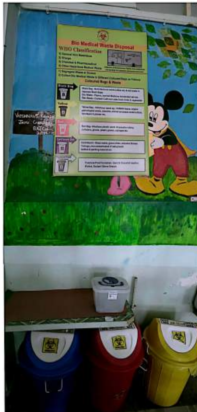
Biomedical Waste Area