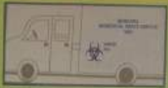
Collection of Biohazardous Wastes from institutions and sending it to common community incinerator