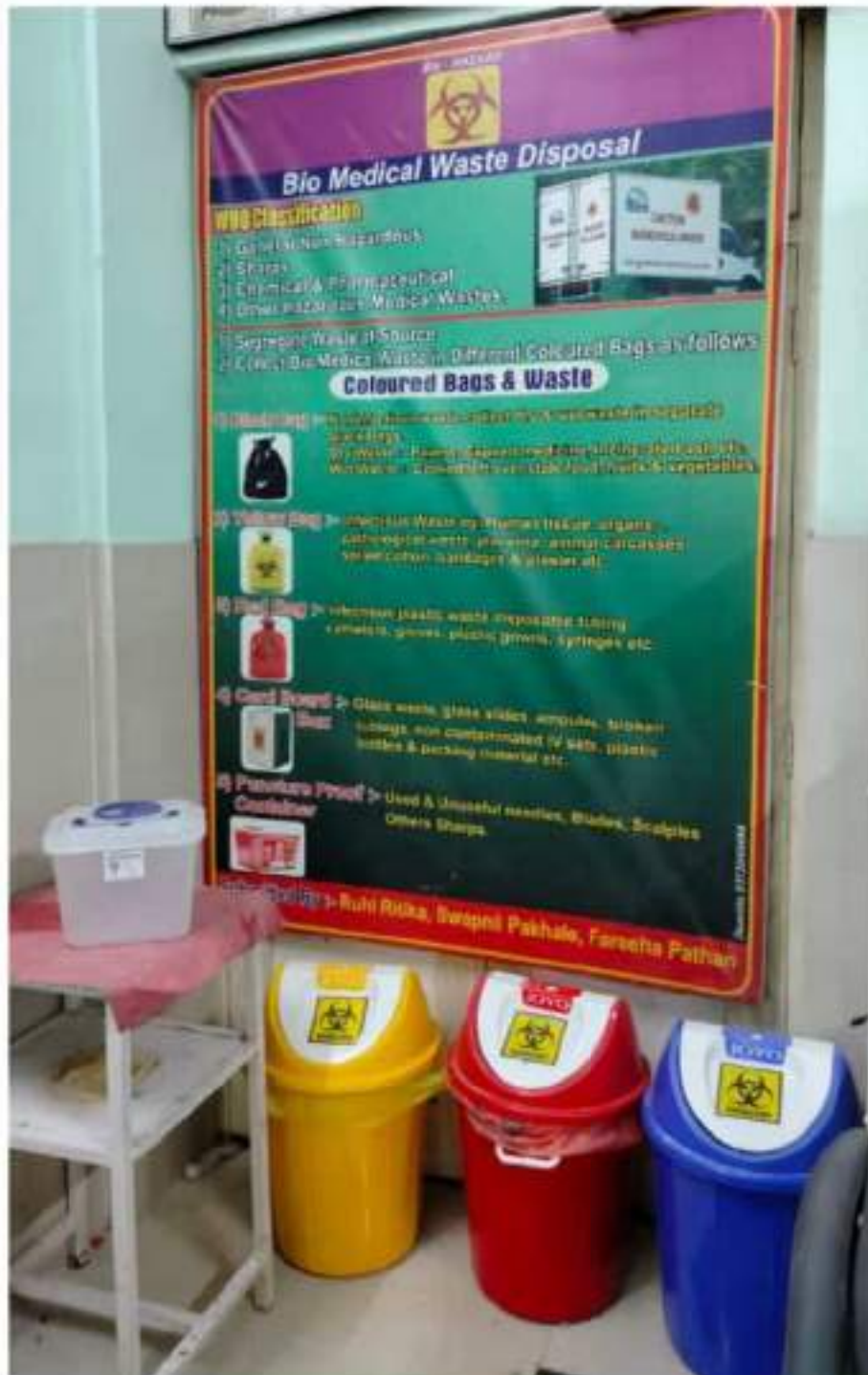
Biomedical Waste Area