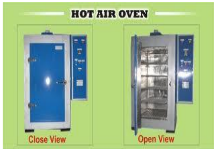
Hot air oven Principle of working: Dry heat