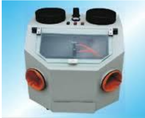
Dental laboratory sandblasters