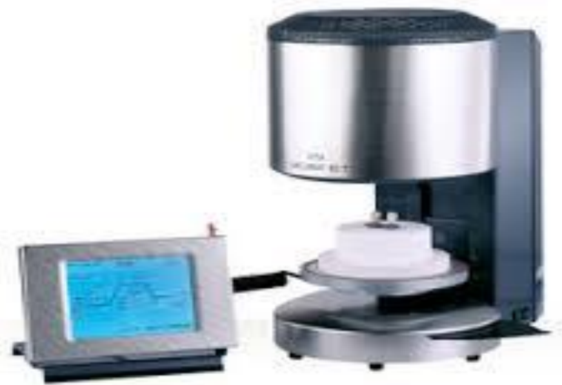
VITA VACUMAT 6000 M Ceramic furnace