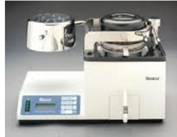
Pressure Molding Machine