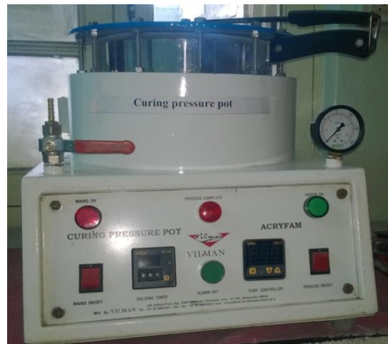
Curing pressure pot