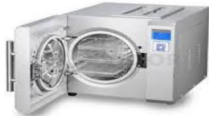
Front loading Autoclave